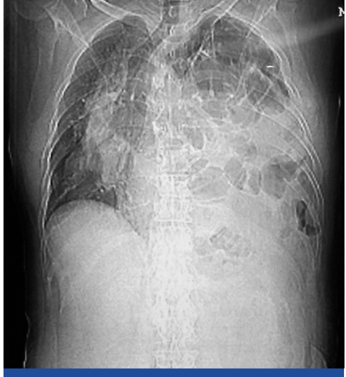
[Table/Fig-1]: Chest X-Ray showing bowel loops in the left hemithorax with gross mediastinal shift to the right

thorax. The abdomen was closed first with a tube drain and the thoracotomy was closed later by deploying an intercostal drainage tube. The patient needed an elective post-operative ventilation for 5 days. The post operative X-rays showed the mesh to be in place, with a mild collapse of the lower lobe of the left lung. The patient had an uneventful recovery and he was discharged on the 14th post operative day. There were no signs of recurrence during these 2 years of the follow-up.